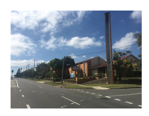
This week's Revd. Morris' message: Where in our lives may we be Divinely called to 'open up'?